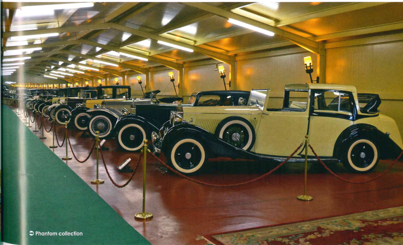
➡ Phantom collection

Alongside these gems is the oldest vehicle in the collection, an 1899 Allen Runabout of which possibly only three examples survive. Its carriage-like appearance hides a single-cylinder engine which transmits the power to the rear wheels by chains giving the vehicle a maximum speed of twenty km/h.