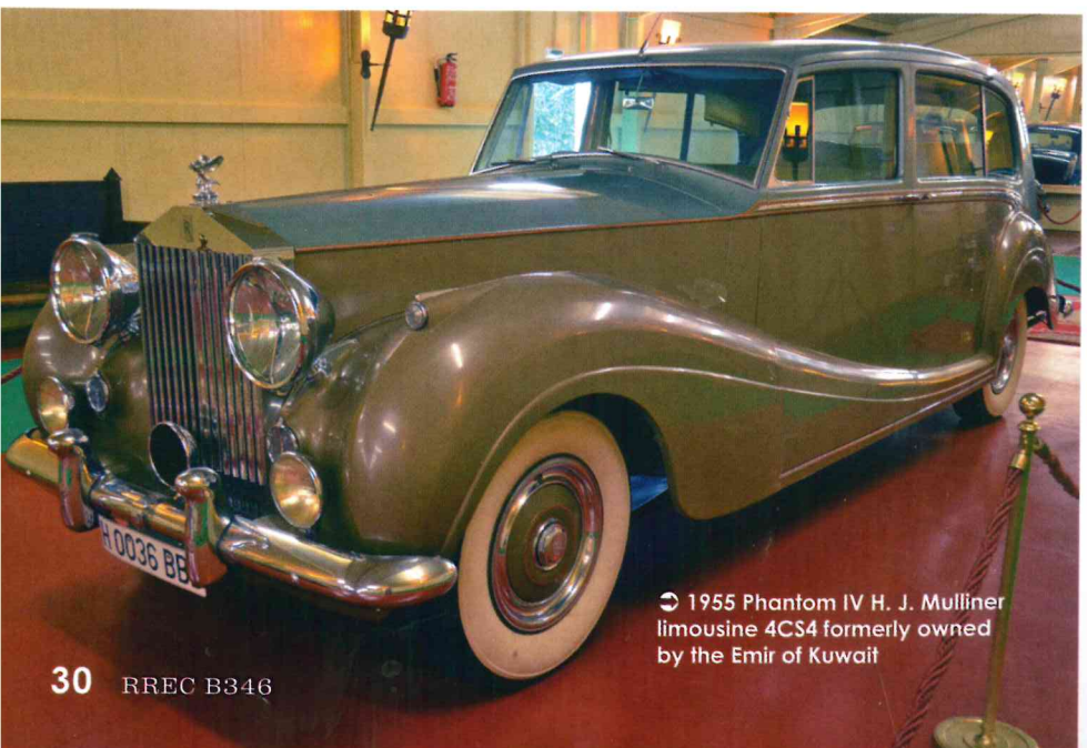
➡ 1955 Phantom IV H. J. Mulliner limousine 4CS4 formerly owned by the Emir of Kuwait

The third hall contains 1980s Italian and British sports cars together with contemporary examples of the Rolls-Royce marque. The remaining three halls are exclusively Rolls-Royce except for a solitary Derby Bentley.