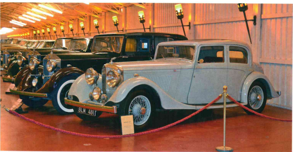
➡ Display of Pre-war RRs with a solitary Bentley: 1935 3½ litre Thrupp & Maberly sports saloon B110CR