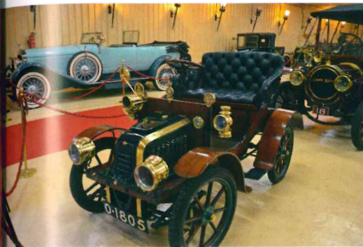
➡ 1903 Peugeot in the foreground with light blue 1925 Isotta Fraschini