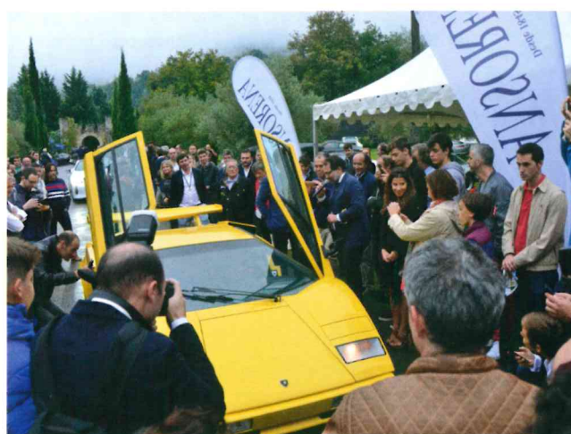
➡ Autobello parade