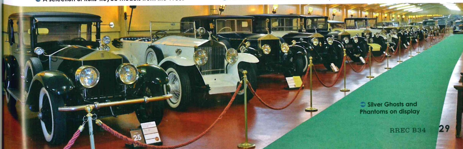
➞ Silver Ghosts and Phantoms on display