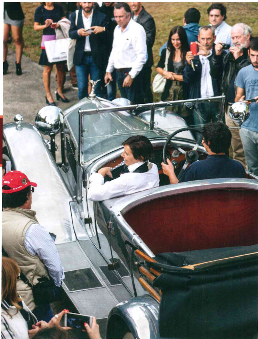
➡ The Autobello 'concour of elegance'