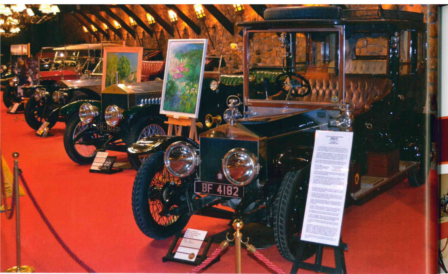
➡ Silver Ghosts with 1912 Barker style Rainsford limousine 1997 in the foreground