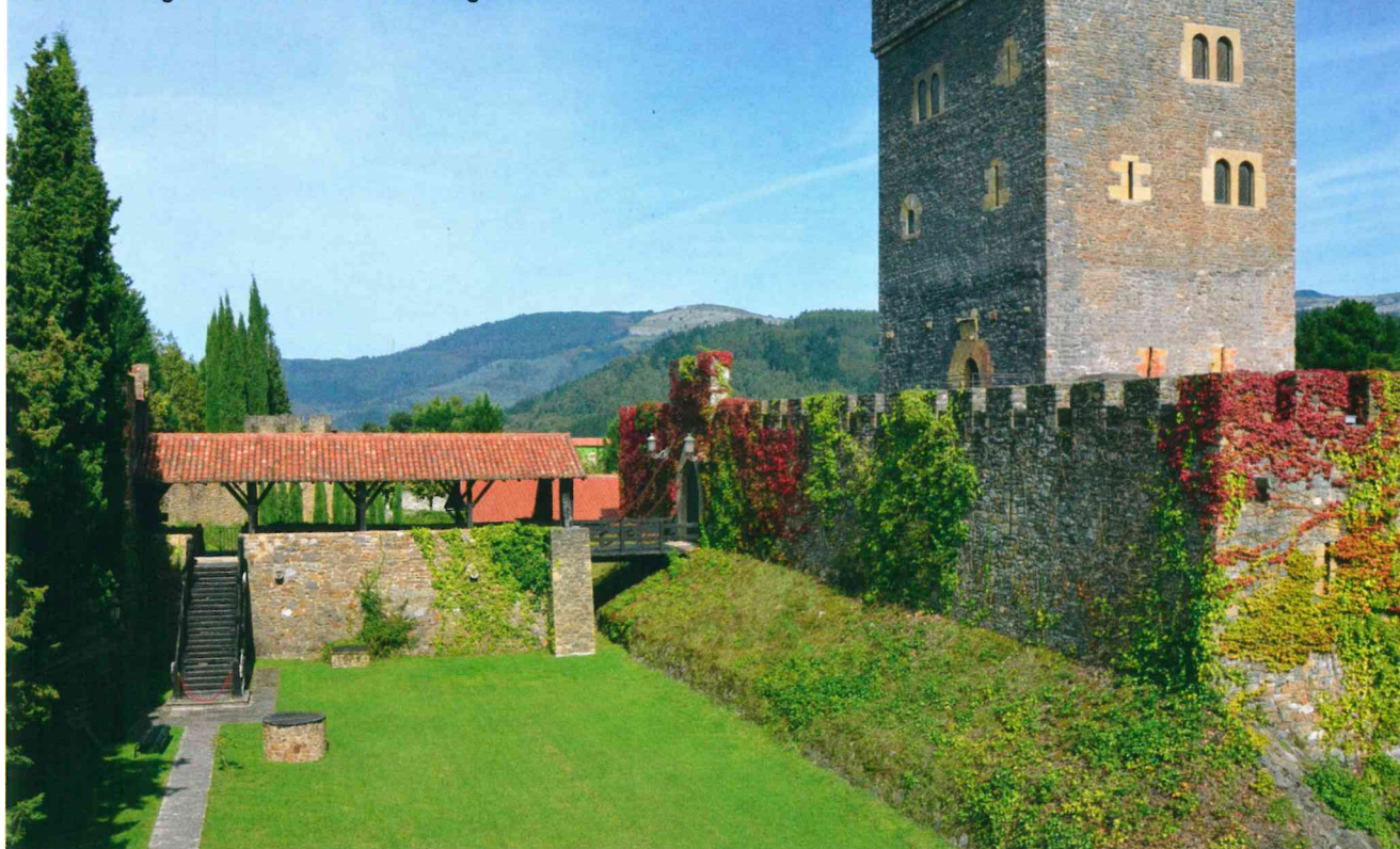
➡ Torre Loizaga and some of the beautiful gardens

Further information about the collection may be found at www.torreloizaga.com