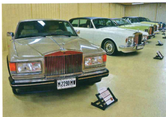
➞ A selection of Rolls-Royce models from the 1980s