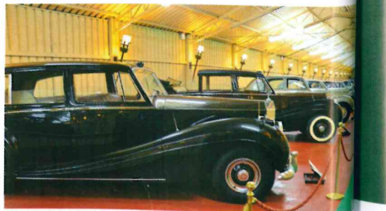
➡ Silver Wraith display with a 1958 Mulliner limousine HLW50, an ex Royal car, in the foreground

What makes the collection special is that not only are there over ten immaculate Silver Ghosts, including 1910 chassis 1462 with a Barker Roi des Belges, as well as some models built at the Rolls-Royce factory in Springfield, Massachusetts, but there are examples of all Phantom models from I to VI, including a Phantom IV once owned by the Emir of Kuwait. In fact there are examples of every Rolls-Royce model manufactured from 1910 to 1988 including two Silver Wraiths that were once used for state occasions by the British Royal family.