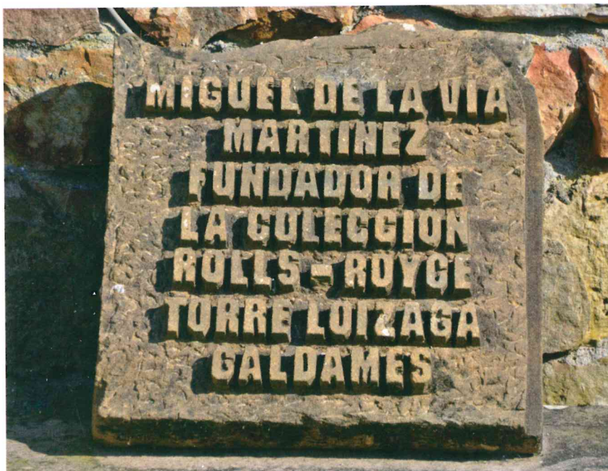
➞ Memorial plaque to the founder of the collection

The collection is spread through six halls. The first hall includes luxurious pre-war machinery made by various manufacturers of the time, including a gorgeous 1925 Isotta Fraschini Type 8, a 1907 Delaunay Belleville 10HP Roi des Belges and a 1936 Hispano Suiza by Van Vooren, along with a selection of horse drawn carriages from an even earlier era. The second hall houses more modern and classic machinery, including Jaguar and Austin Healey, as well as a unique English "Merryweather" fire engine.