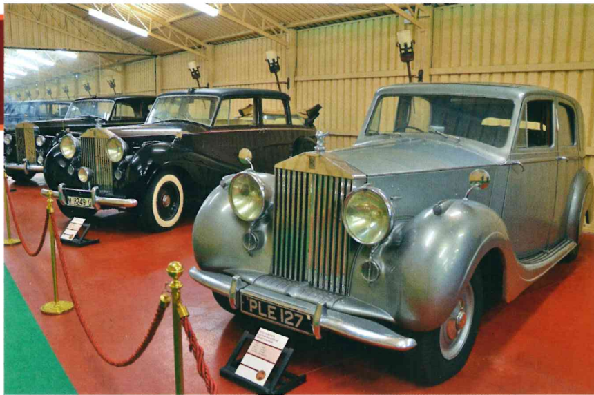
➡ 1948 Park Ward saloon WZB4 with two former Royal cars (in the background) as part of the Silver Wraith display

Alongside these gems is the oldest vehicle in the collection, an 1899 Allen Runabout of which possibly only three examples survive. Its carriage-like appearance hides a single-cylinder engine which transmits the power to the rear wheels by chains giving the vehicle a maximum speed of twenty km/h.