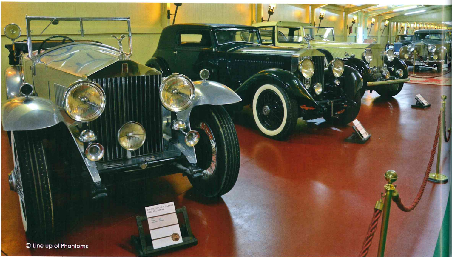
➡ Line up of Phantoms