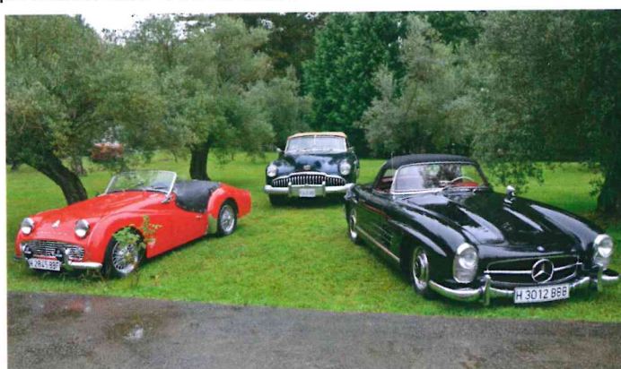
➞ Prize winners in the Autobello competition